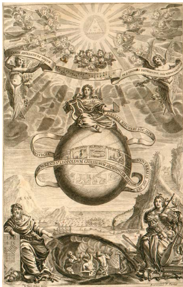
Figure 1. Frontispiece of Athanasius Kircher, Musurgia universalis (1650).

seventeenth centuries, the European Age of Encounter would also produce the potential for global musicological moments, the best known of which is probably Athanasius Kircher’s 1650 compendium of musical objects from the world, Musurgia universalis (see Figure 1). 23