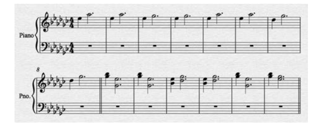
Figure 2. The Struggle for the Family Leitmotif. By Sofía López

The development of this block of music, which goes with the images, can be divided into two parts. In the first instance Maggie is in the hospital, thoughtful in front of the window. Here the melody plays with chord of intervals of 3<sup>rd</sup>, 4<sup>th</sup>, and 5<sup>th</sup> ascending and descending, in a tone of Eflat minor, with a structure of ostinato ritmico , as happens metaphorically with the protagonist, who does not know what is going to happen.