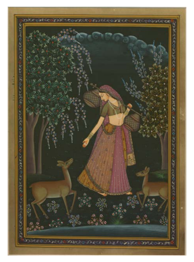
Figure 3. Rāgamāla Painting of Rāgini Todi. (Personal collection of Philip V. Bohlman)

The importance of rāga in that emerging global aesthetics should not be underestimated, and for that reason I make a brief excursion to Indian musical aesthetics that potentially allows us to reroute the intellectual history of music scholarship more generally. I turn, in fact, to one rāga, the many manifestations of which came to enter a new global musical aesthetics in the eighteenth century. I speak here of the rāga, or rāgini, Todi, for whom an aesthetic language coalesced in what we can understand as the Indian enlightenment. The aesthetic language used to express the ontological meanings of rāga encompasses a remarkable range of the arts, among them the religious narratives and visual designs of the tradition of miniature painting known as rāgamāla (see Figure 3).