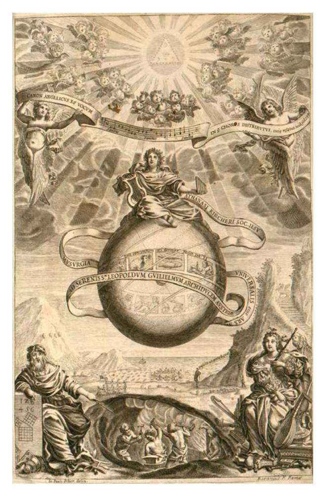
Figure 1. Frontispiece of Athanasius Kircher, Musurgia universalis (1650).

seventeenth centuries, the European Age of Encounter would also produce the potential for global musicological moments, the best known of which is probably Athanasius Kircher's 1650 compendium of musical objects from the world, Musurgia universalis (see Figure 1).<sup>23</sup>